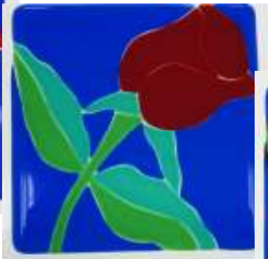
The glass is fused into a solid pane