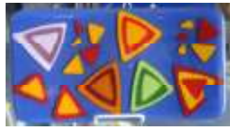
Table space is limited to the first six people who book for the day. Since all projects are different, the cost of the class will vary with the projects you select. There is NO CHARGE for the instruction. You pay only for your supplies and kiln time.

No idea what to do? ... between the amazing fused glass projects in our store, an ever growing catalog of designs and Marija's ever-churning and profoundly creative mind ... WE HAVE HUNDREDS OF IDEAS!