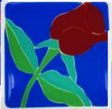
The glass is fused into a solid pane