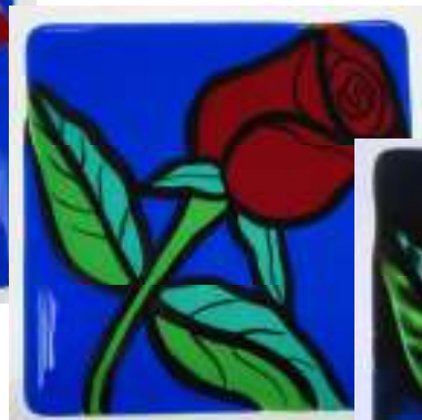
The elements are outlined