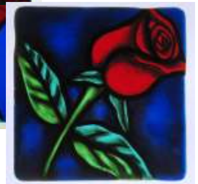
Shading is used to bring the art to life