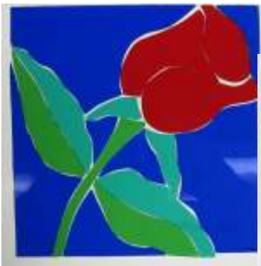
The glass is cut and ready for fusing

Our 2012 date will be announced in early November