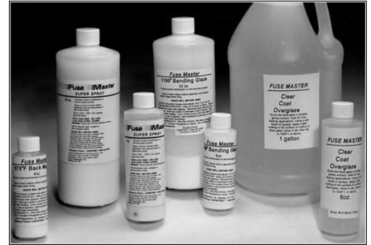
The FuseMaster family of fine overglaze products.

Soak ceramic fiber products in this hardener to give them rigidity. Fiber mold hardener can be used with fiber paper, fiber board and fiber blanket. Once applied fire to 1200°F in a vented area and kiln to burn out the binder and to cure the mold. The resulting durable fiber forms can be used for bending molds, support walls, kiln furniture or other high temperature forms. Perfect for making drop-out rings.